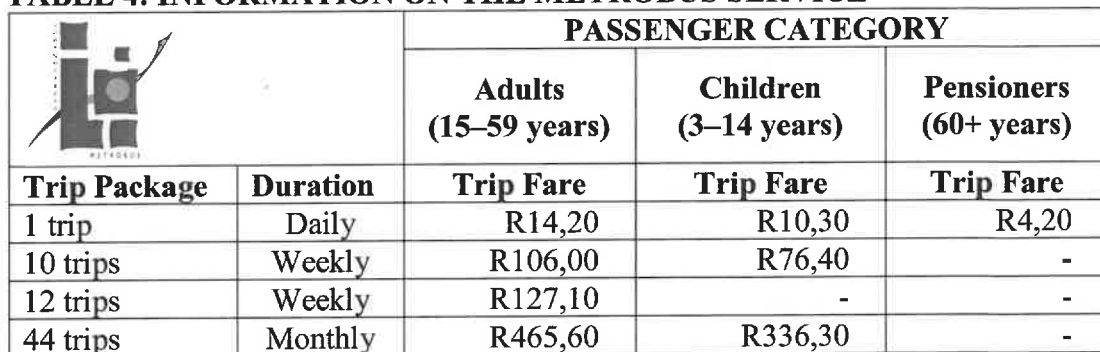
TABLE 4: INFORMATION ON THE METROBUS SERVICE

TABLE 4 below shows information on the Metrobus service in Johannesburg for three categories of passengers travelling by bus.